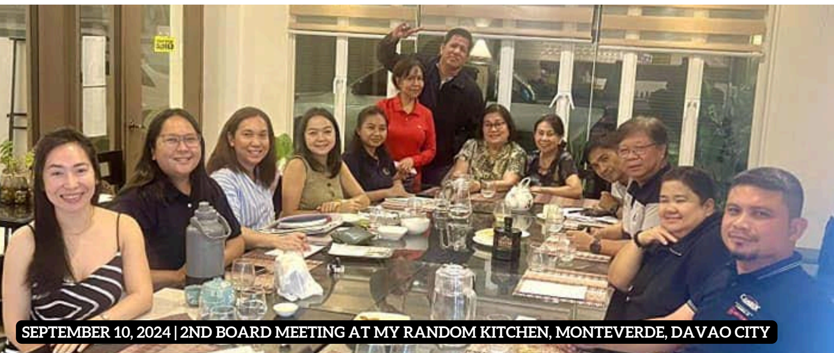
SEPTEMBER 10, 2024 | 2ND BOARD MEETING AT MY RANDOM KITCHEN, MONTEVERDE, DAVAO CITY