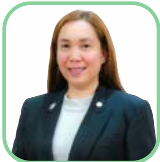
KRIZIA Z. TAN Travel Agency Travel Best Guide